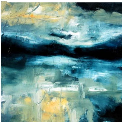
In the Moment IV. Mixed. 48" x 48"