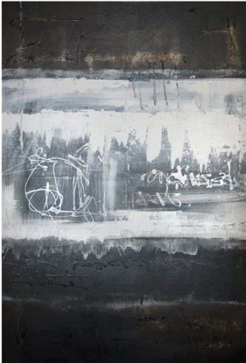
"AWAKE CONCRETE" 48 X 70 ACRYLIC/CANVAS