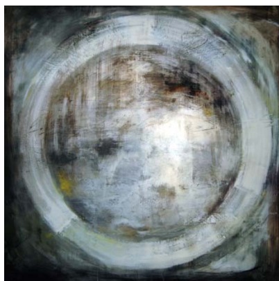
Intimate Continuum VI. Mixed. 64" x 64"